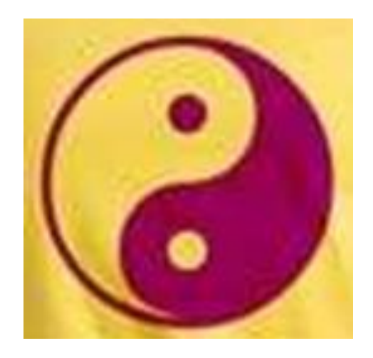
My Solar plexus chakra is a being of violet fire My Solar plexus chakra is the purity God desires (3x)