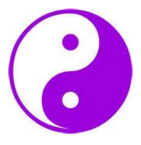
My Soul chakra is a being of violet fire My Soul chakra is the purity God desires (3x)