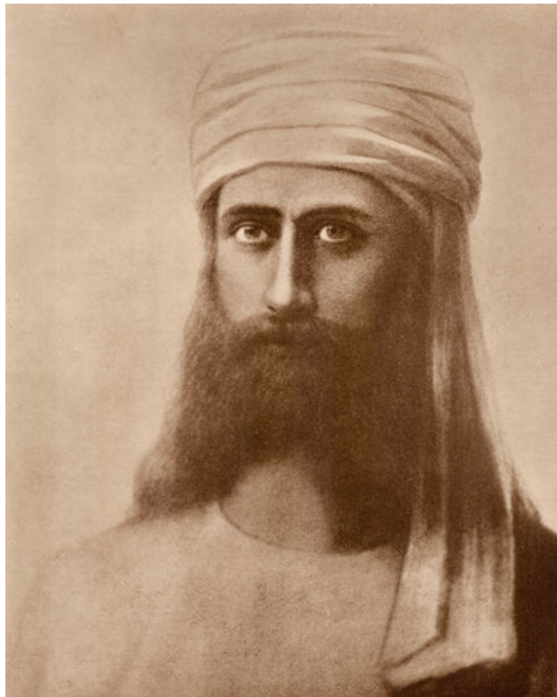
Master MORE as he appeared in early 1900's, Now he is MORE!